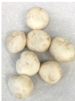
ProduceShield Plus pH=5.5