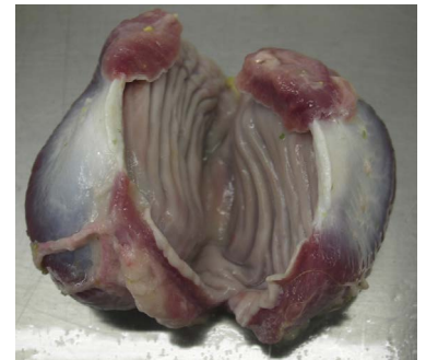
"A-Grade" Finished Gizzard Example