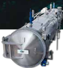
TUNA VACUUM PRE-COOKER COOLER