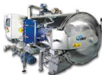
STEAM WATER SPRAY (SWS™)