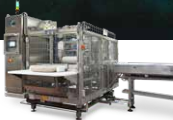
AUTOMATIC TUNA LOINS FEEDER