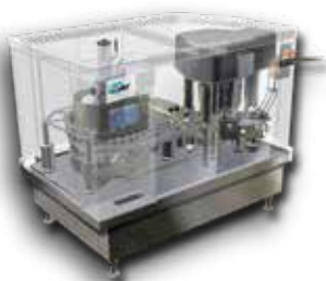
TWINTEC™ FILLER & CLOSER