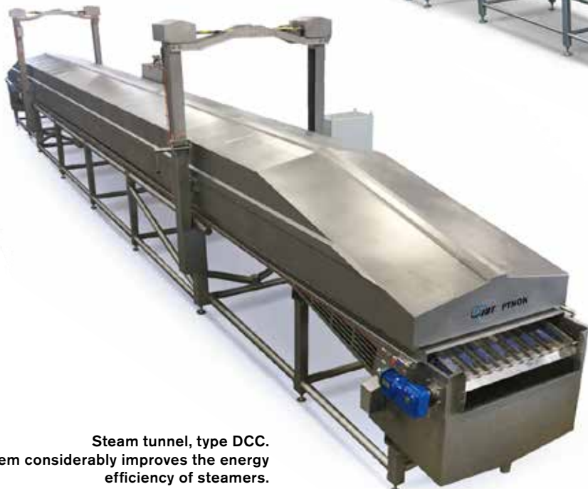
Steam tunnel, type DCC. The DCC system considerably improves the energy efficiency of steamers.