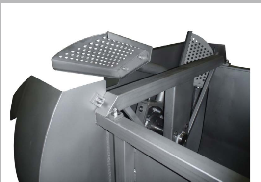
SINGLE BARREL GIBLET CHILLER