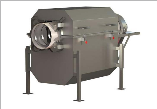
LPS-112-PAW WATER SCREEN