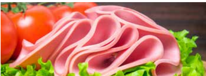
Crust freezing and stabilizing deli products, to improve throughput, yield and hygiene in slicing operations.