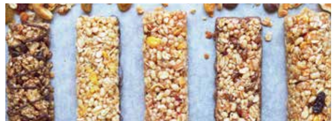
Stabilizing soft food and sticky confectionery before further processing.