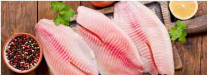
Quick, cost-effective freezing of high-volume, high-throughput flat products.