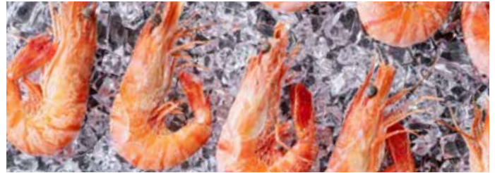
Freezing a wide range of thin or flat products, including high-value IQF products.