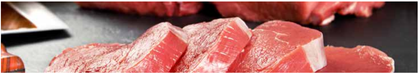
Rapidly super-chilling raw meat products for safer chilled distribution.