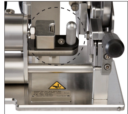
Ergonomic design eliminates worker strain via a knurled cylinder clamp that firmly grips casing to pull product.