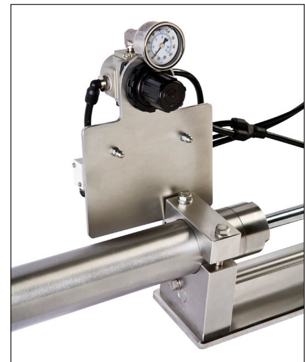
Adjustable air pressure gauge provides optimum package tightness.