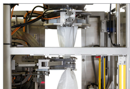
Hands-free automated filling and clipping for reduced labor requirements.

clipped end of the bag in the direction of the packing area. The SBCS system is controlled through an Allen-Bradley PLC and HMI touchscreen interface that allows for recipe setup and communicates vital diagnostic information.