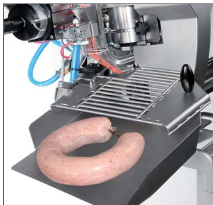
Specially developed for ring-shaped products such as pork sausage, ring-shaped salami, blood sausage and liver sausage.