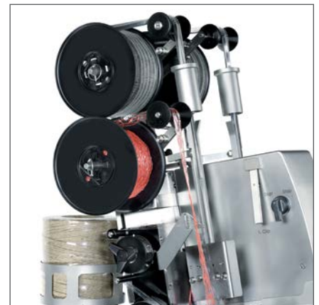
Spool clips, string loops and string dispensers for efficient production.