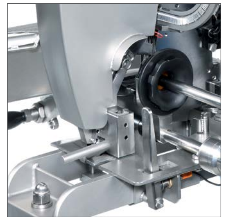
Lever control for same size portions in terms of appearance.