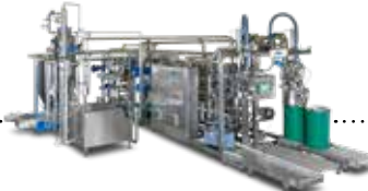
READYGo™ ASEPTIC MONOBLOCK