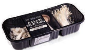
PRODUCE | C-PET