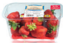
PRODUCE | A-PET