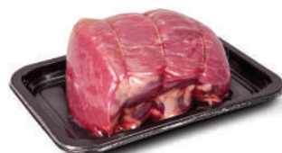
FRESH MEAT | POLYPROP