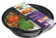
READY MEALS | C-PET