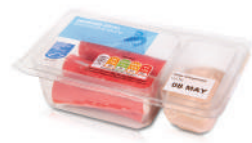
SEAFOOD | A-PET

for more information UK +44 (0) 1625 856 600 America +1 804 447 9038 Australia +61 (0) 3 9397 0955