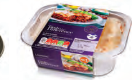
READY MEALS | SMOOTH WALL FOIL

for more information UK +44 (0) 1625 856 600 America +1 804 447 9038 Australia +61 (0) 3 9397 0955