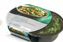
PRODUCE | C-PET