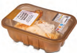
POULTRY | POLYPROP