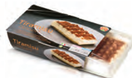
PUDDINGS | A-PET