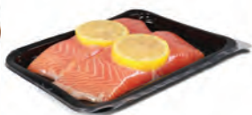
FISH | POLYPROP