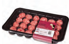
RED MEAT | POLYPROP