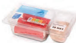
SEAFOOD | A-PET