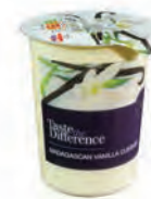
PUDDINGS | A-PET