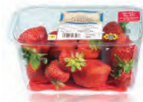
PRODUCE | A-PET