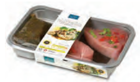
FISH | SMOOTH WALL FOIL

for more information UK +44 (0) 1625 856 600 America +1 804 447 9038 Australia +61 (0) 3 9397 0955