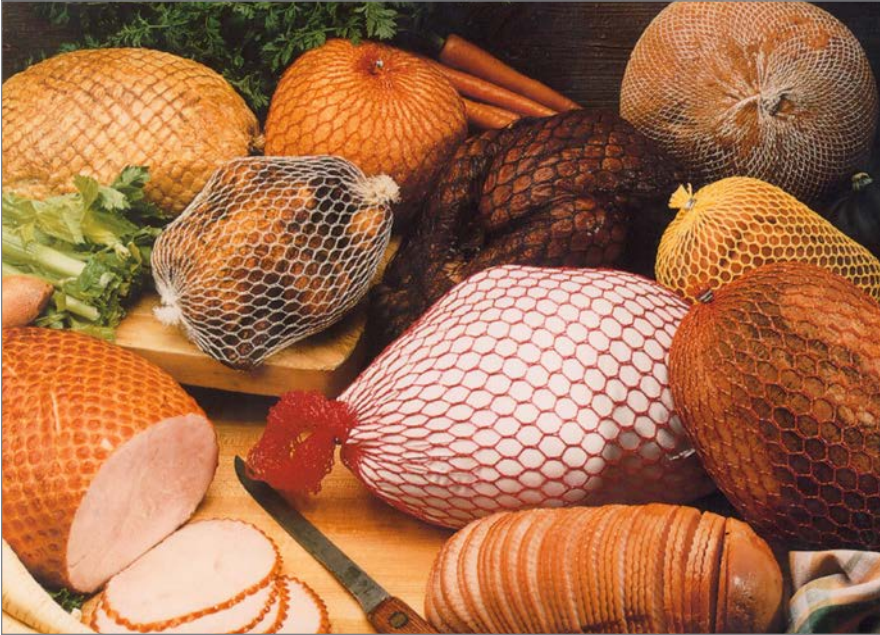
Double clippers accommodate a wide range of products including those in netting.