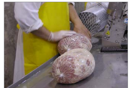
Netted meats securely clipped, ready for hanging in the smokehouse.

High-quality clips are essential to a successful clip closure. TIPPER TIE clips are manufactured from a special aluminum alloy and are held to exacting specifications that exceed those from the general wire industry. The dimensions of all TIPPER TIE clips are kept within very tight tolerances, ensuring a perfect closure every time. Furthermore, clip leg ends are radiused and lubricated to ensure that both clip legs form simultaneously and uniformly as the clip gathers the packaging materials. The result is a clip that closes smoothly and securely every time.