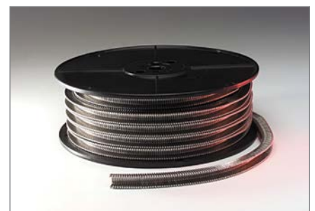
Choose from a variety of stick or spool mounted clips.