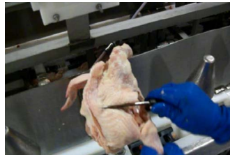
Shoulder cut to expose breast