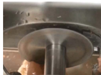
Tender Tendon cut with CTTC-1