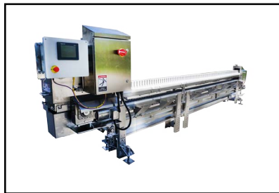
CWS-1 Wing Segmentor