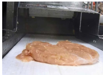
Breast skinned with CSK-Series Skinner