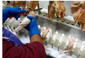
Wing removed and placed in CWS-1