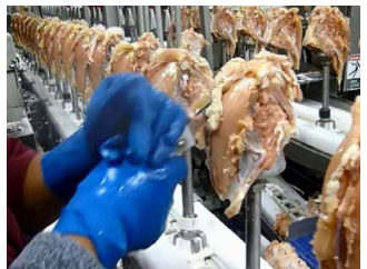
Tenders scored to ease removal