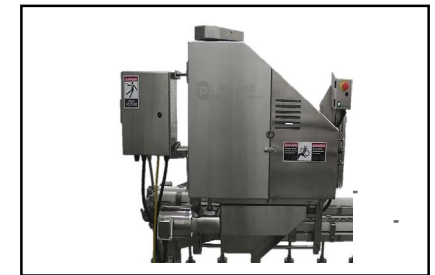
CKH-1 Keel Harvester