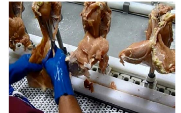
Breast removed, placed on conveyor