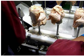
Front halves placed on cones