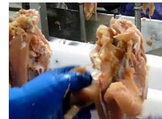
Tenders removed by hand for best yield