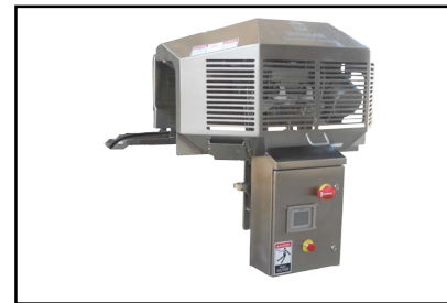
CTTC-1 Tendon Clipper