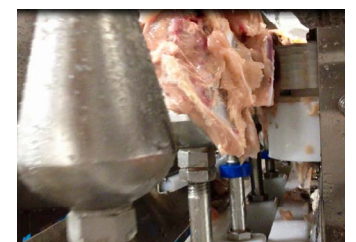
Keel removed with CKH-1