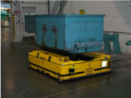
The photos above show the old AGV system carrying a roll and waste bin.