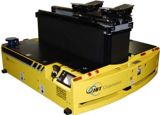
Low Profile Automatic Press Loading Vehicle